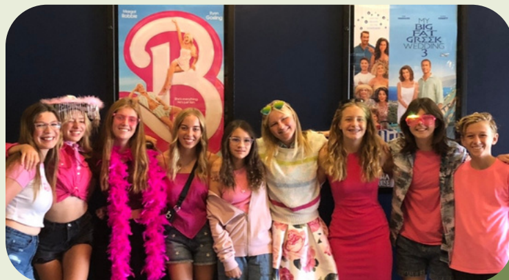
We had a blast in 2023!